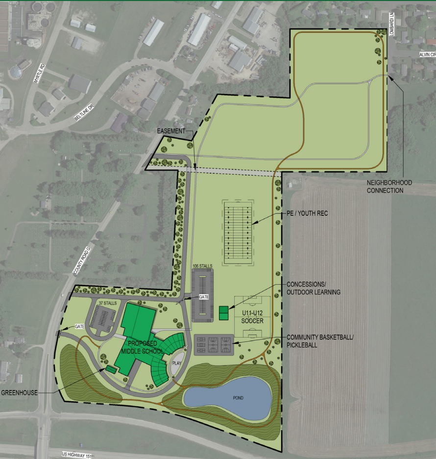
NEW BEAVER DAM MIDDLE SCHOOL Proposed Site Plan