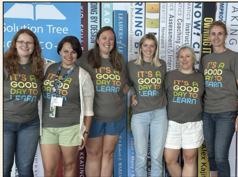
A group of our BDMS teachers were on a learning journey this summer at the Professional Learning Communities Institute in Madison

To read about this year’s recipients or for more info, visit https://bit.ly/3Z5dFsS .