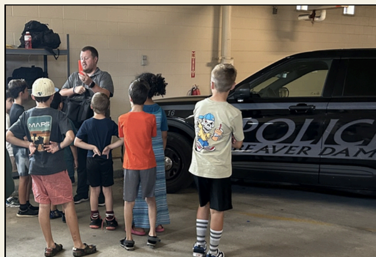
Students in our Intro to Police Work class got to take a trip to the Beaver Dam Police Department during the last week of summer school!

“Shall the Beaver Dam Unified School District, Dodge County, Wisconsin be authorized to issue pursuant to Chapter 67 of the Wisconsin Statutes, general obligation bonds in an amount not to exceed $107,000,000 for the public purpose of paying the cost of a school building and facility improvement project consisting of: construction of a new Middle School building and campus, including community and athletic space improvements; construction of additions, renovations and building infrastructure improvements at Washington Elementary School; district-wide safety, security, ADA accessibility, recreation and site improvements; possible removal of all or part of the existing Middle School building; and acquisition of furnishings, fixtures and equipment?”